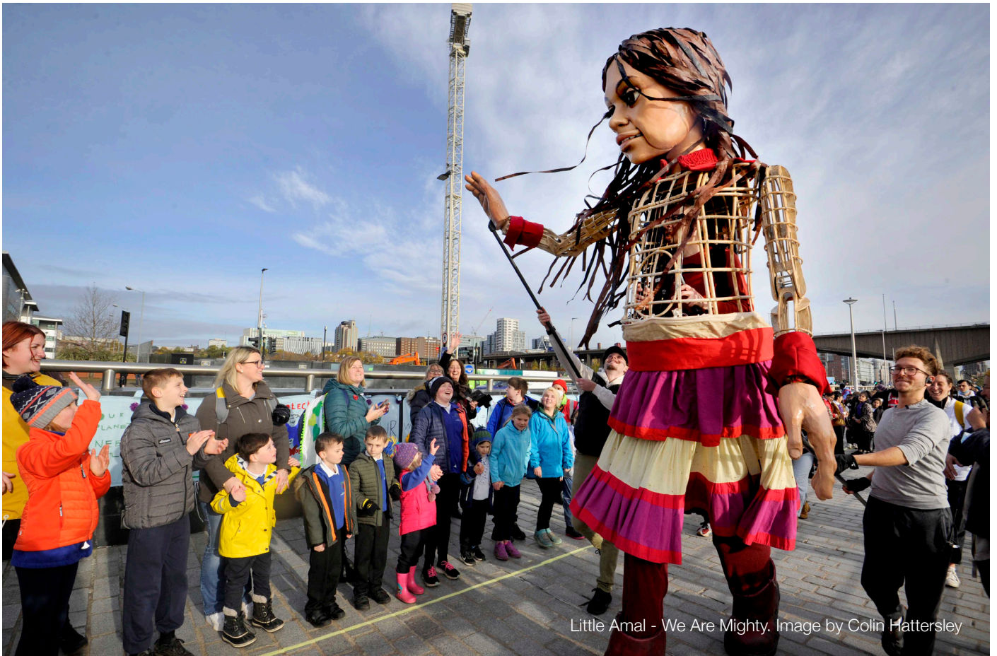
Little Amal - We Are Mighty.

“The project has empowered pupils and given them a voice in effecting change in the climate crisis. They are beginning to make more conscious decisions about their everyday actions that impact the environment. They understand that they have the right to live on a clean and healthy planet and that they must work together to minimise the effects of climate change.”