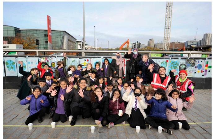
St Albert's Primary School.