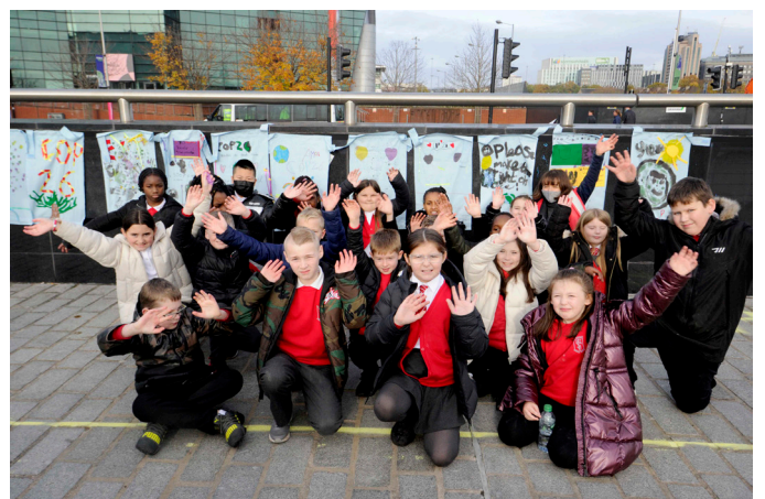
St Teresa's Primary School.