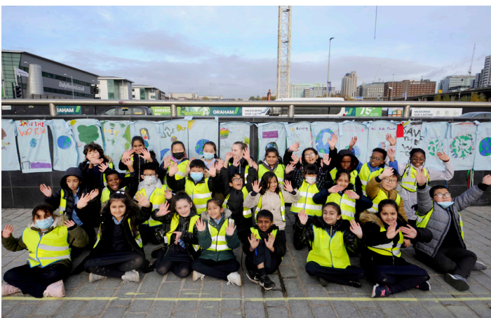
St Joseph's Primary School.