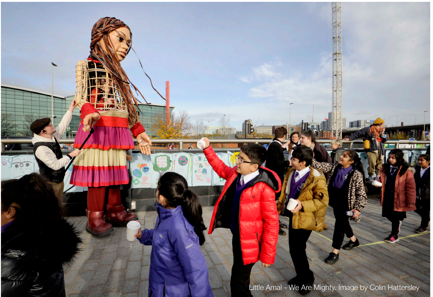
Little Amal - We Are Mighty.

“We felt mighty when we created a chant and performed this during the march to COP26. We know that we can save the world even though we are young. We have the right to a clean environment and we have the right for our voices to be heard.”