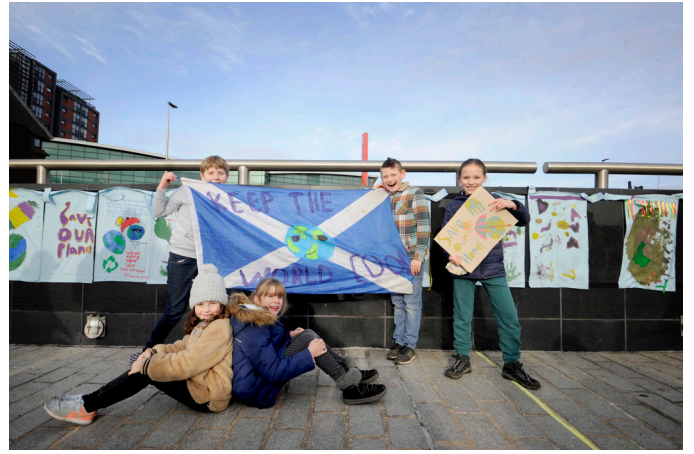
Comrie Primary School.