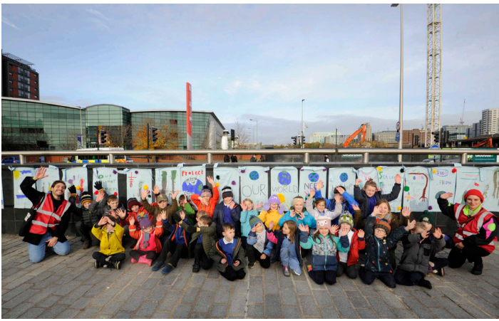
Grandtully Primary School.