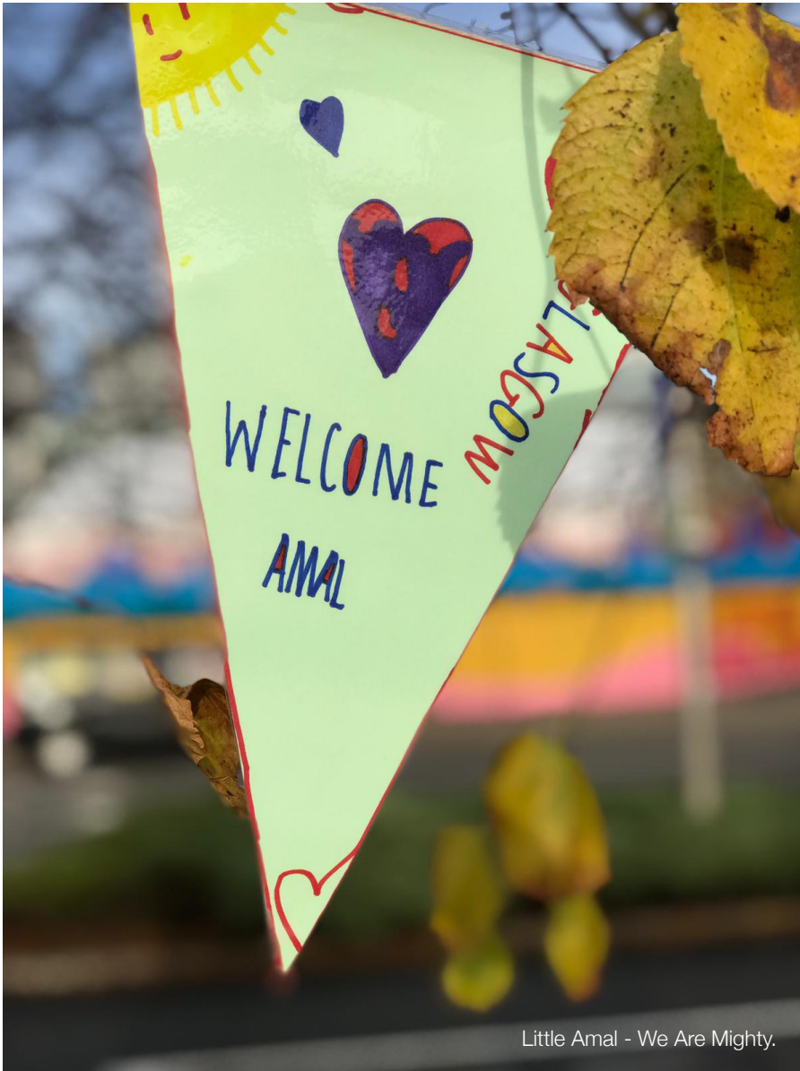
Little Amal - We Are Mighty.

A selection of images from workshops at Grandtully Primary School and St Teresa's Primary School as well as images of Little Amal meeting the school children on the day can be found at this Dropbox link .