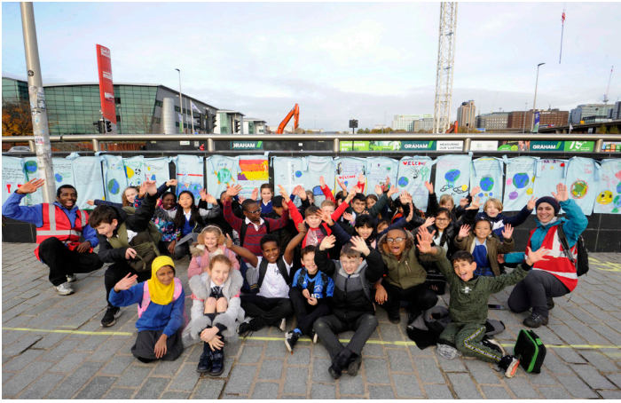
Blackfriars Primary School.